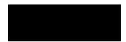
Exhibit #1 Aquatic Resources

US Army Corps of Engineers St. Louis District